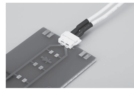
Combination of KEO-3W-2P and KES-3R-2P