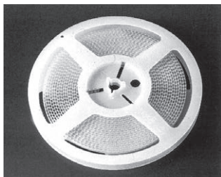
HK-3- □ -T (tape-and-reel)