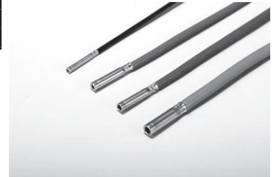
RS- □ - □ -50 (color)