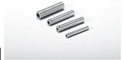
RS- □ - □ -P